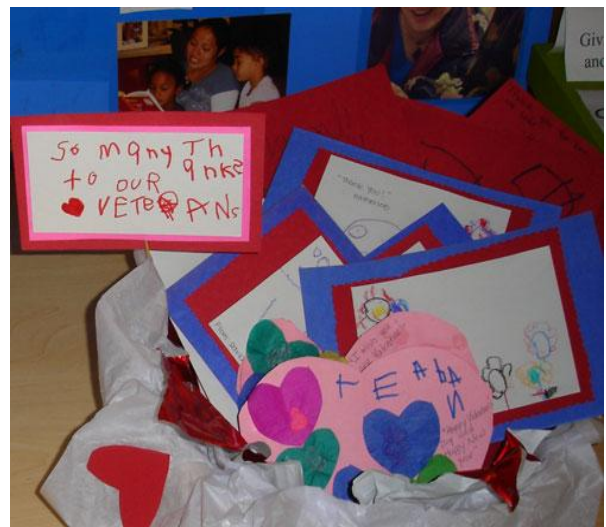
Valentines for veterans